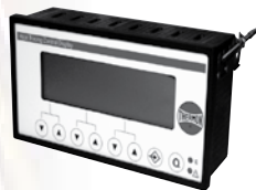
TC 816 Display